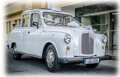
Lillie – 5 passengers €170.00 one way