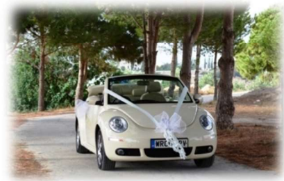
Bonnie – 3 passengers €105.00 one way