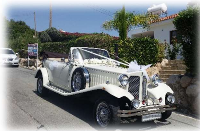
Belle – 2 passengers €180.00 one way